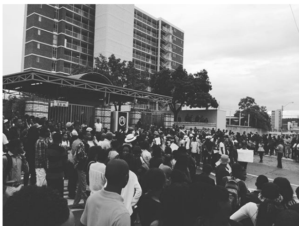
Student protests contesting registration fees at NUST, January 2016.

The Namibia University of Science and Technology, as a public educational institution, has the opportunity and responsibility of setting an example on how to attain a different, more equitable, vibrant, and innovative urban development. The project concept note below outlines a collaborative approach, going beyond formal master-planning, and engaging with larger questions of land values, urban design, planning processes, and doing so in close collaboration with inhabitants and stakeholders in inclusive and innovative ways.